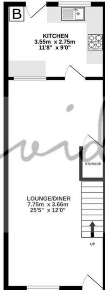
1ST FLOOR 38.5 sq.m. (415 sq.ft.) approx.